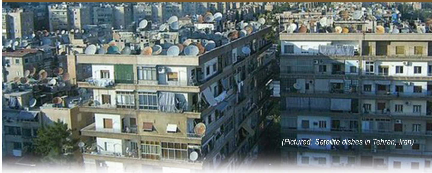
(Pictured: Satellite dishes in Tehran, Iran)