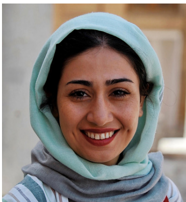
(Representative Photo: Religion Unknown)

I started praying that the Lord would show himself to my mom at the right time. Weeks passed. When my mother saw how calm and respectful I was, even when she was angry and cursing me, she became curious. One night she recanted: "Turn on the television and show me what you have