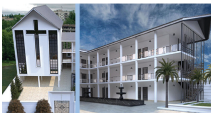
Proposed Church/School/Radio Station