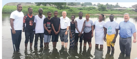
Below: Baptizing eight new converts