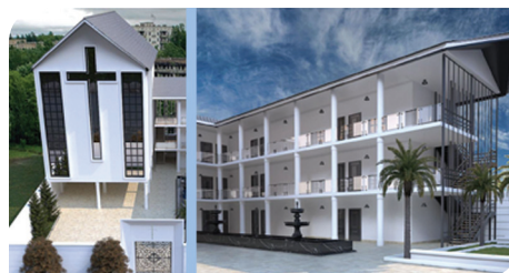
Church/School/Radio station building